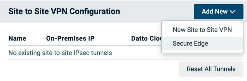
Fig. 1 - Secure Edge dropdown in Recovery Launchpage, network view

The result? Faster RTO, lower risk and a smoother, simpler recovery experience.